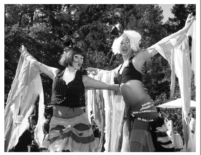
Mystic Family Circus performers at the Gala.