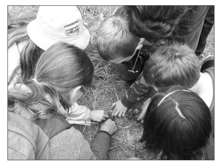
Fourth graders investigate insects with Docent.

Additionally, the docents create strong connections with each other. Sharing common interests and the bond of working together for a greater good makes for a lovely group of people to spend time with!