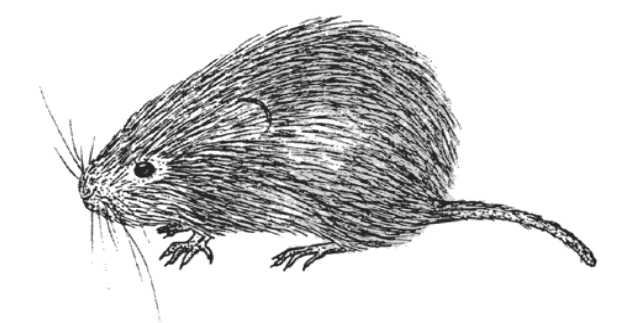
California vole (Microtus californicus)

So why bring all this up? As Restoration Program Director I am challenged with making decisions that result in cost-efficient successful projects that follow ecological principles and achieve the goals we set out. The described method that blends agriculture and ecology is highly efficient in both initial implementation and ongoing maintenance. By saving resources on a project we are able to implement more projects elsewhere. And given the number of miles of unvegetated