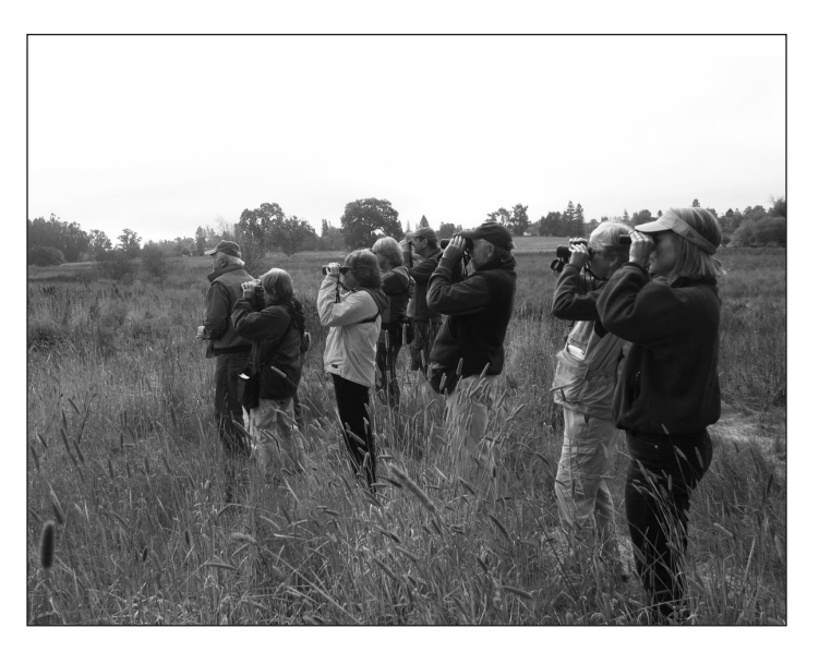
Docents birdwatching at City of Santa Rosa's Brown Farm.

Docenting for the Laguna is important and deeply meaningful work—and it truly is fun. It benefits schools, children, the community, the Laguna and each person who becomes a docent feels the rewards personally from experiencing the wonder of nature with children.